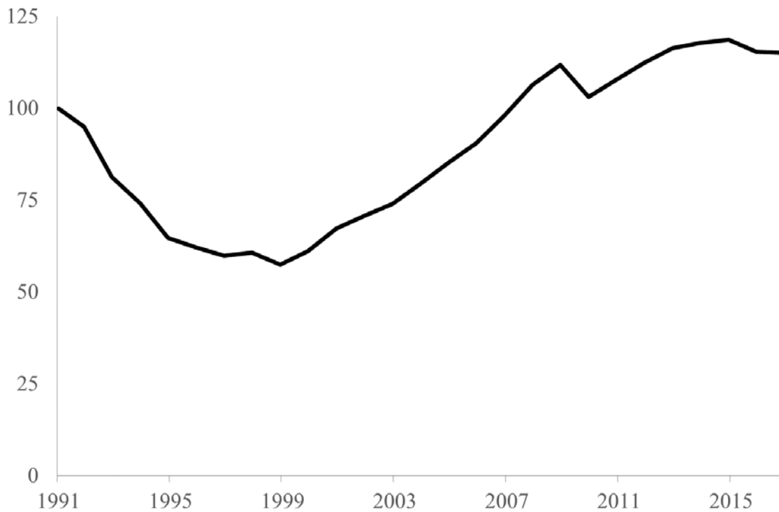
Figure 1 Indexed real Russian GDP 1991-2016, rubles (1 January 1991 = 100)