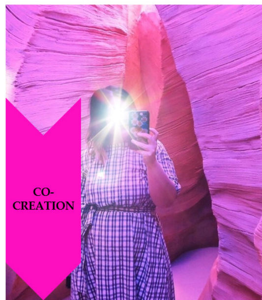
Figure 2. The Glossier's canyon and co-creation as the intermediary body of theory.

The common characteristics of episodic retail settings in the exemplars that are presented in Figure 2–4 are the collaborative patterns in consumption and production that epitomise conduits for co-creation enacted through consumption cultures. This phenomenon has been described as consumers' creation of value, and it is showcased in customer-to-customer activities in cases like Ludic and Wikipedia [36–39]. The reasons that lie behind such consumer behaviour have been documented as altruistic desires to contribute to something beyond the self, construct identity, engage in self-expression, be recognised by peers, earn social capital, and develop personal relationships [39].