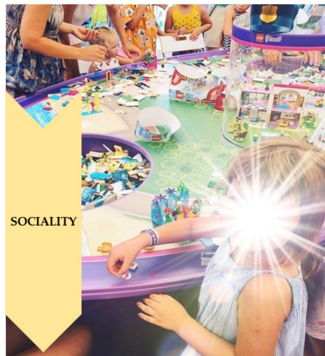
Figure 4. Lego and sociality as the intermediary body of theory.

Lastly, to better understand and examine the strategic design of episodic retail settings, it is herein proposed that the intermediary body of theory related to exemplar C is sociality.