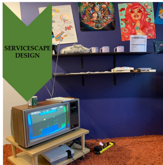
Figure 3. Showfields Lab and servicescape design as the intermediary body of theory.

To better understand and examine the strategic development of episodic retail settings, it is thus suggested that the intermediary body of theory regarding exemplar B is servicescape design through storytelling.