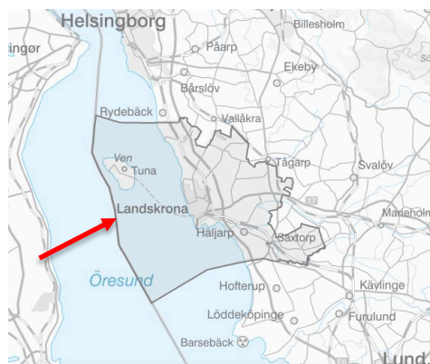
Figure 1. Map over Landskrona.

Historically Landskrona has suffered from a tough economic and social situation due to the shutdown of the ship industry in the 1980's which generated problems such as unemployment, criminality and xenophobia (Listerborn & Baeten 2016). However, for a period of time there's been a decreasing trend regarding these factors, for example nowadays Landskrona has the lowest number of reported crime since year 2000 and the unemployment has decreased (Landskrona stad 2019). Yet the city still suffers from the reputation as a dangerous and unsafe city (ibid.).